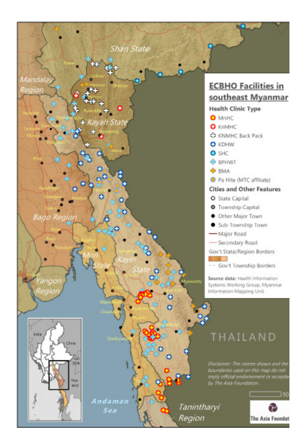
Map 2 – ECBHO Facilities in SE Myanmar

ECBHOs all use similar training curricula and have similar workforce structures that are substantially different from those of the MoH. ECBHOs use cadres of health workers who perform advanced clinical tasks to fill the gaps created by a lack of available doctors and nurses in ECBHO target areas. For example, ECBHO medics, trauma medics, and emergency obstetric care workers can perform amputations and other treatments for war-related injuries, as well as handle complications during childbirth. These are tasks done by doctors and nurses and midwives in the MoH system. ECBHOs argue that this system has been developed to use the human resources available in eastern Myanmar as efficiently as possible to address the most prevalent health problems there. <sup>15</sup> Most ECBHO facilities do not