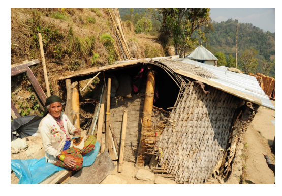
As monsoon season approaches, families who were displaced and live in temporary shelters like this one in Nele VDC, are increasingly concerned.