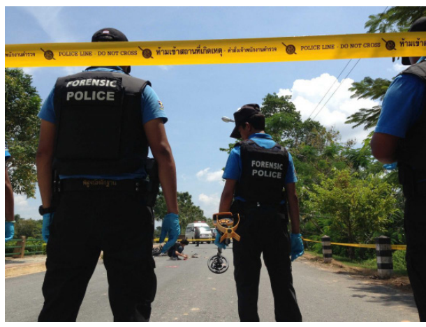
Thai forensic police investigate a bombing in the Deep South. While data points to a reduction in violence, recent conflicts are a troubling reminder of the simmering conflict.

On August 12-14, 2016, as Thais were celebrating the long holiday marking the Queen's birthday, a series of 13 coordinated explosions rocked several provinces in Thailand's Upper South, including popular tourist spots in Hua Hin, leaving four people dead and 30 wounded, including 10 foreigners. Forensic evidence points to the opposition group known as the Barisan Revolusi Nasional (BRN) as the likely perpetrators. While data suggests that violence associated with the protracted subnational conflict in Thailand's southern border provinces has been on the decline in recent years, the latest surge in attacks in and outside the Deep South is a troubling reminder of the long-simmering conflict, which since 2004 has left over 7,000 dead and more than 10,000 injured. Read more from Santi Nindang, a senior program officer for The Asia Foundation in Thailand, here.