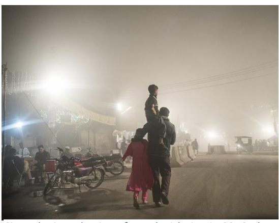
Since the introduction of new legislation in 2016, there has been an increase in the number of child abuse cases in Pakistan reported daily.

Recently, Pakistan erupted in protest over the rape and murder of a 7-yearold in Kasur. Pakistan's parliament passed the Criminal Law Amendment Act of 2016, making offenses of child sexual abuse and pornography noncompoundable, non-bailable, and punishable with prison sentences up to seven years, and/or fines up to 500,000 rupees, following widespread protests in response to media reports of an organized gang in Kasur accused of sexually exploiting and filming approximately 300 children. Despite this, almost all of those accused in the Kasur case of 2015 have since been acquitted due to alleged witness intimidation and other social taboos and destructive notions of honor that perpetuate injustice. The Punjab Government has also taken steps to improve public safety over the past few years, even introducing child protection units in majority districts and installing closed circuit TV cameras throughout the province, but have not helped reduce the number of child abuse cases. These examples legislation on paper, independent of effective implementation and provisioning of services, simply provides a "semblance" of safety and by itself, cannot protect Pakistan's children. The