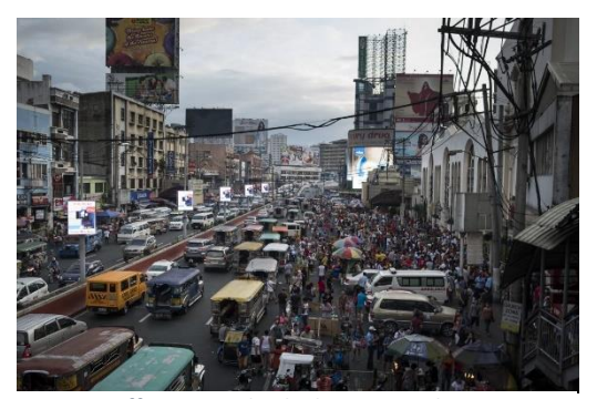
Heavy traffic jam in both directions along a major road in Quiapo, Manila, Philippines. An average city commuter spends over an hour stuck in traffic jams like this.

The Philippines ranked 56th out of 137 countries in the World Economic Forum's latest <u>Global Competitiveness Index</u>, with the lack of infrastructure investments significantly undermining the country's ability to compete globally. President Duterte's "<u>Build, Build, Build</u>" initiative pledges to usher in a "golden age of infrastructure" in the next five years but <u>much needs to be done</u> in addressing inequity in development and resource allocation at the local level. Since 2011, the <u>Coalitions for Change</u> (CfC) program, aimed to more closely link public infrastructure investment with local economic priorities, has leveraged a total of $1.9 billion to fund 298 roads and infrastructure projects identified by local business associations in partnership with provincial governments. Last year's revisions to the guidelines of the Local Road Network Development Plan (LRNDP) encourages locally driven decision-making and priorities which is a major step in ensuring that local economic development needs are not neglected. Read more about our programs in the <u>Philippines</u>.