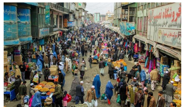
Afghanistan continues to face enormous challenges in 2018, and whether or not the National Unity Government can hold elections in 2018 will be critical.

There is no doubt that 2017 put Asia to the test . From religious and ethnic tensions spilling out onto the streets to game-changing elections that brought forward new leaders and toppled old ones, to coping with devastating natural disasters like the floods in South Asia, Asia has seen many ups and downs. Continue reading the blogpost to find out what Asia Foundation's experts view as the pivotal issue in their respective countries in 2018. Click here to find out where the Asia Foundation works and here to find out what we do.