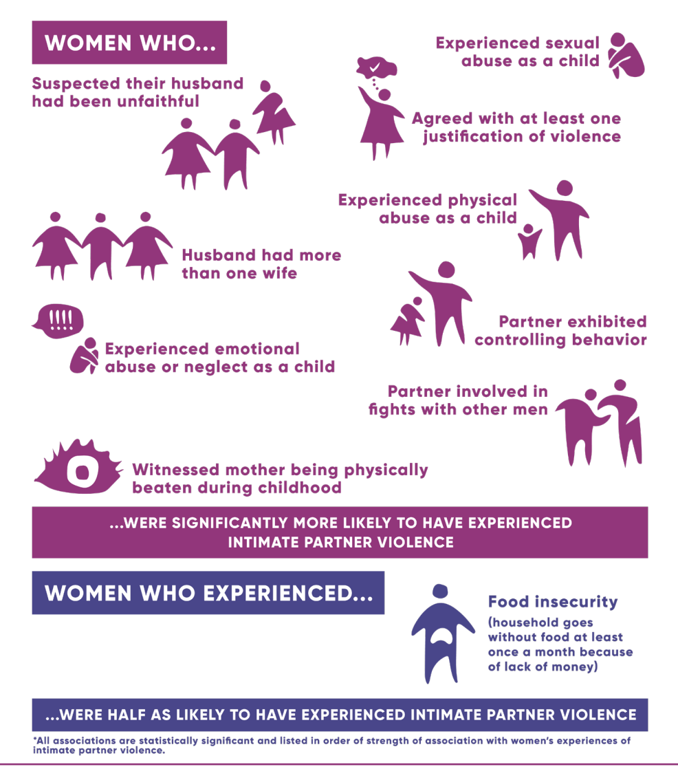
Figure 4: Factors associated with women's experiences of intimate partner violence, Nabilan study