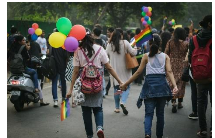
Delhi Queer Pride Parade, November 12 2017.

The Supreme Court of India recently overturned a 157-year-old law criminalizing homosexuality— section 377 of the Indian Penal Code. In its decision, the Court cited research indicating that about 8 percent of India's population of 1.3 billion identify as LGBTQI. In real numbers, that is approximately 104 million people, roughly equivalent to the entire population of the Philippines in 2017 . Seventy-one countries worldwide still criminalize same-sex relations, and the Supreme Court's decision has the potential to advance other decriminalization efforts in the South Asian neighborhood. Freed from legal sanctions, India's LGBTQI community can now make its presence felt in the nation's economy. Learn about the Foundation's programs in India .