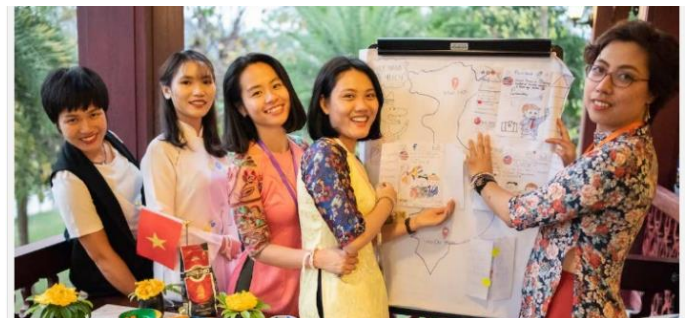
Participants from Vietnam showcase their display on tourism in their home country.

The recent tourism boom has unfortunately resulted in an influx of garbage which predominantly ends up in the Mekong river, damaging the environment and communities who rely on the river for sustenance. In March 2019, 50 young entrepreneurs from ASEAN and Timor-Leste met in Luang Prabang, Laos, for the Young Southeast Asian Leaders Initiative (YSEALI) Ecotourism Workshop, organized by The Asia Foundation, to consider how to leverage the tourism boom to make things better. In five days of intensive group work, the participants developed strategies for their own communities, received one-on-one mentoring from ecotourism experts, made site visits to successful ecotourism businesses, and learned how to pitch their ideas for seed funding, with 12 participants emerging victorious. Learn more about the Foundation's programs in Laos and on leadership and exchanges .