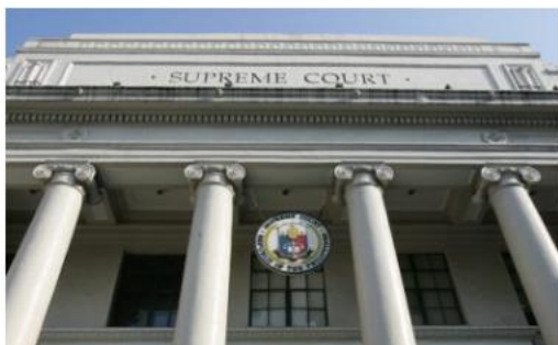
The Philippines Supreme Court.

The Continuous Trial Monitoring System (CTMS) is software that monitors compliance with the court's Continuous Trial system, a new set of rules to streamline procedures and expedite criminal cases, including strict timetables for trial courts. A pilot project developed in collaboration with The Asia Foundation, CTMS captures information on the nature of each case; the identity, age, sex, and birthdate of the accused; and the case history, including dates for each stage of the proceedings. The scope of the CTMS is limited to criminal cases for now. The project is part of a broader push by the Supreme Court to use electronic information systems to bridge long distances, streamline court bureaucracies, and reduce the paper-based transactions that have defined judicial administration in the country since the 1930s. Read